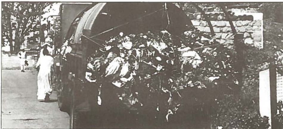
An overloaded City Council garbage truck.

At the World Environment Day Exhibitions held in June 1994, a non-governmental organization (in formation), Kenya Environmental Promotions Network (KEPNET), presented a play titled, "Who's to blame?". In this play, residents in a certain urban residential estate came together to solve a crisis which involved a tenant accusing another of emptying food remains on her plot. After the usual tongue-lashing, the residents considered carefully whose duty it was to dispose waste. The play ends with all of them agreeing that since the local authority did not collect garbage or unblock clogged sinks, they, as individuals must take on responsibility for these tasks for the betterment of the community. The idea that citizens of cities also have a responsibility towards the maintenance of the city's environment may be a new one, but it is one which will have to be increasingly accepted, especially in growing, overburdened cities such as Nairobi.