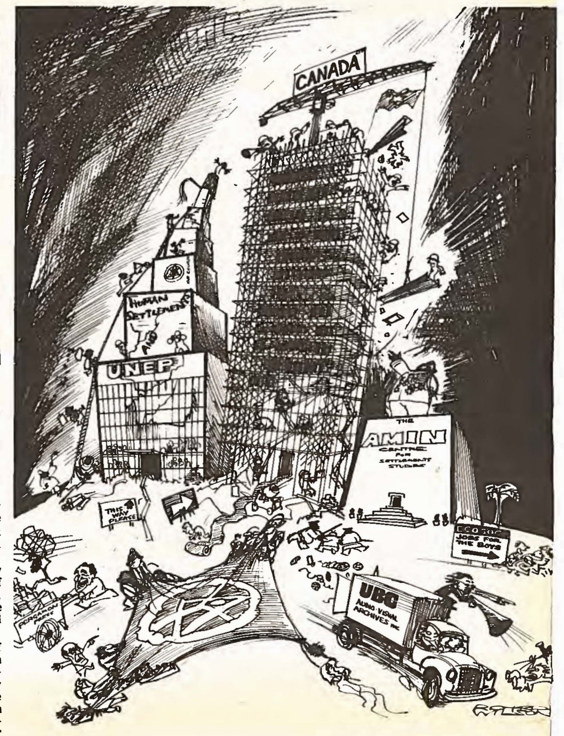
Empire building — a popular conference sport

In another generation the problems will have reached such magnitude that they will require nothing short of genius and heroism in order to save man's Habitat for another hundred years.